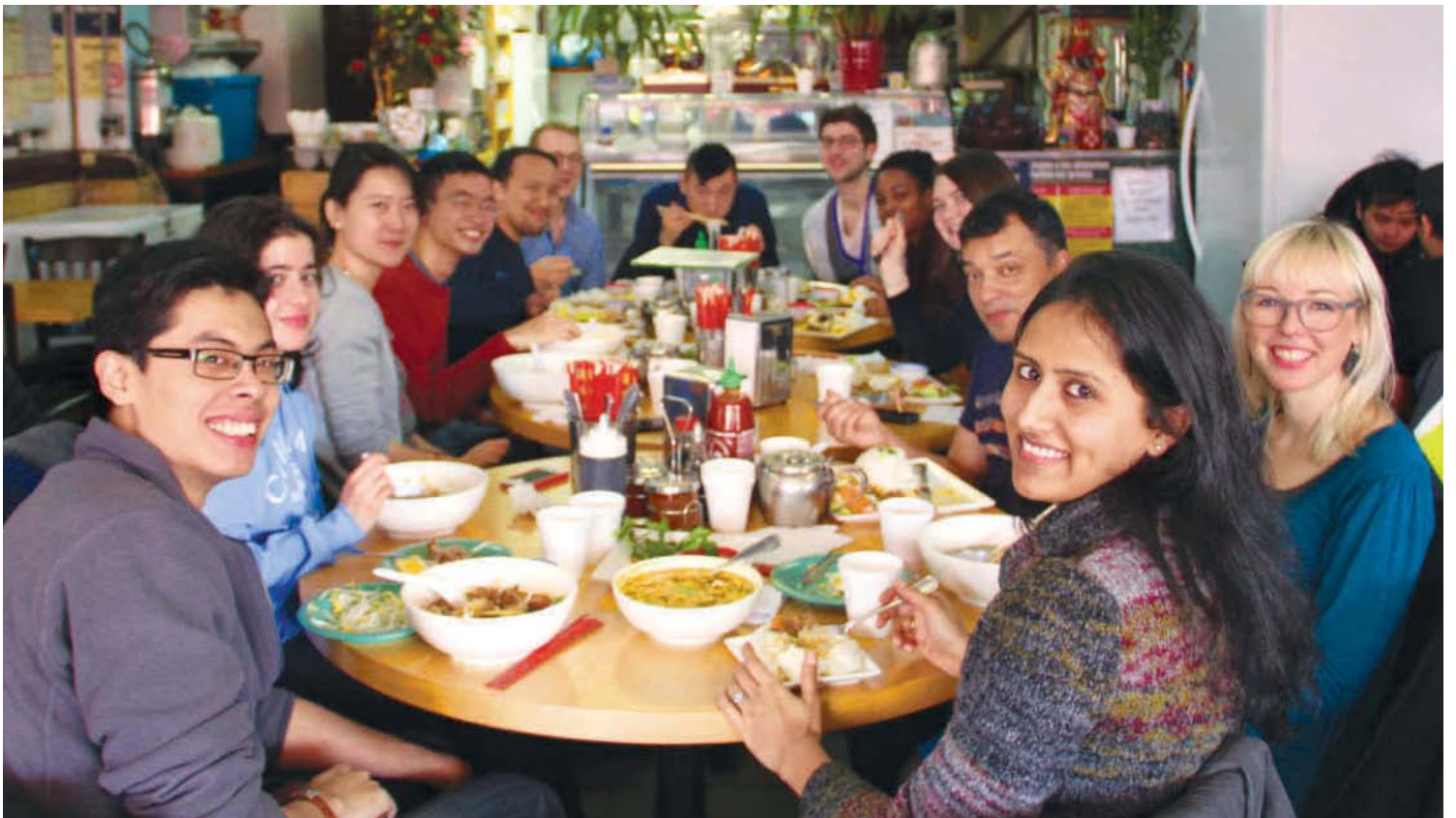
Vietnamese food in the Bronx