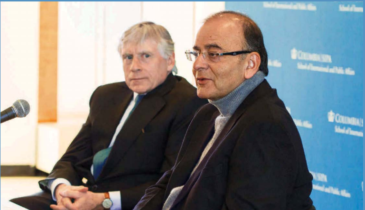
On March 2, Arun Jaitley, India's finance minister, spoke at SIPA about economic challenges and opportunities for India. From left to right: Columbia President Lee C. Bollinger and Jaitley