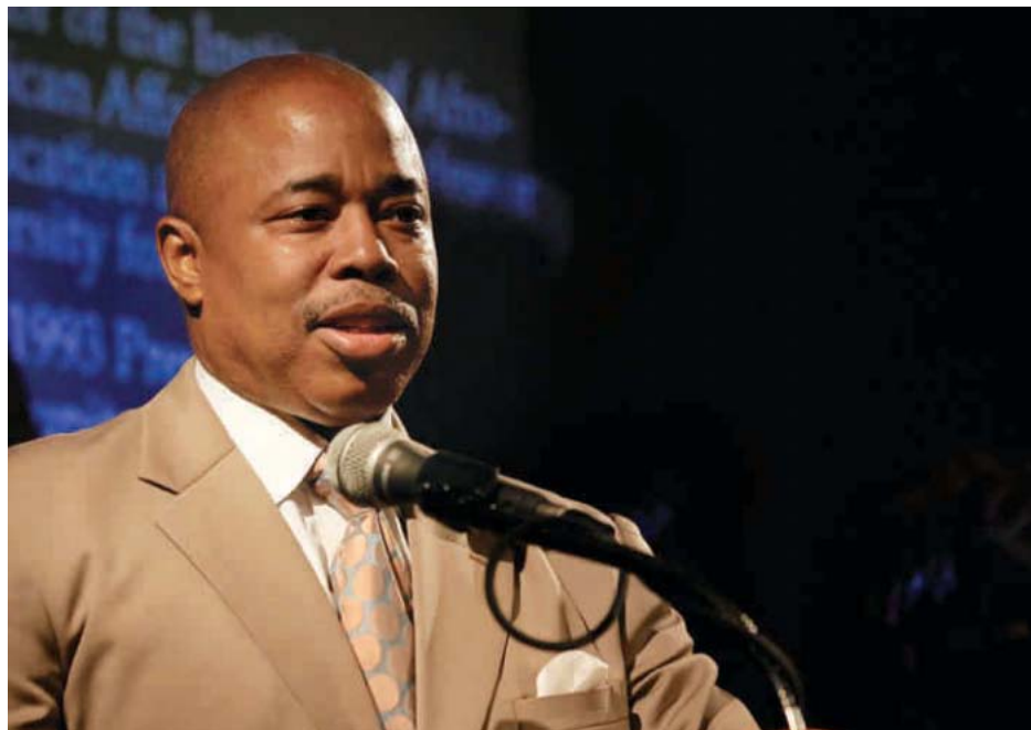
Brooklyn Borough President Eric Adams

Referring to events in Ferguson, Missouri, earlier this year, Adams said, “You can’t say black lives