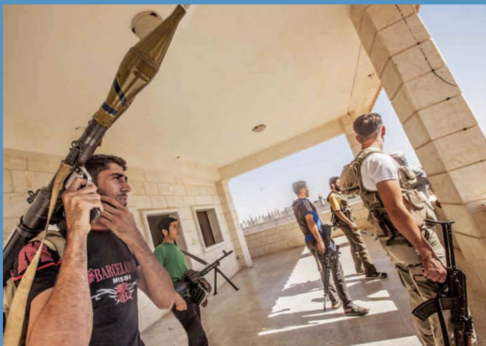
Rebels of the Free Syrian Army in rebel-controlled building on July 26, 2013, in the Aleppo countryside, Syria.