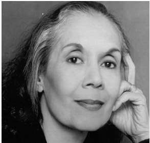
Carmen de Lavallade