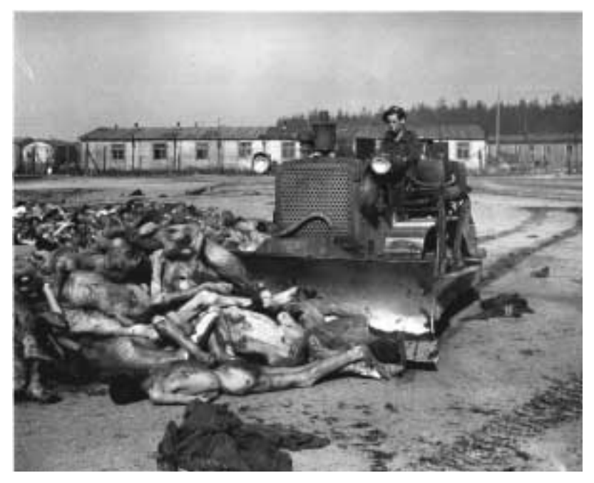
Figure 5. A British soldier clearing corpses at Bergen-Belsen

looking beyond the fence, inside the gate of death, at death itself. The postmemorial generation, largely limited to these images, replays, obsessively, this oscillation between opening and closing the door to the memory and the experiences of the victims and survivors.<sup>27</sup> The closed gates and the bright lights are also figures for photography, however—for its frustrating flatness, the inability to transcend the limit of its frame, the partial and superficial view, the lack of illumination it offers, leaving the viewer always at a threshold and withholding entrance.