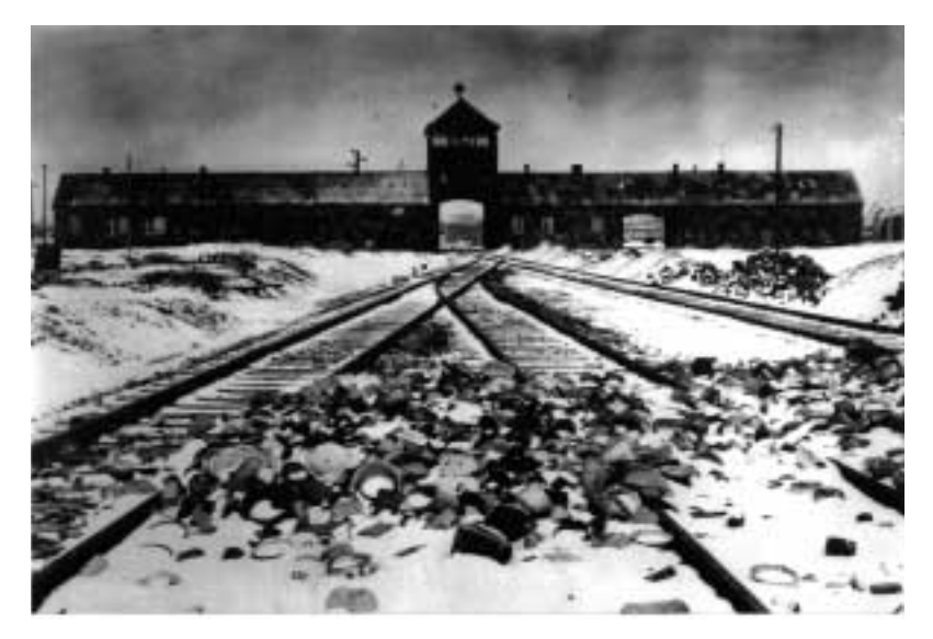
Figure 4. The main rail entrance of Auschwitz -Birkenau just after the liberation of the camp

self, the illusory promise that one could become free if one could only do the work of memory and mourning that would open the gate, allow one to enter back into the past and then, through work, out again into a new freedom? The closed gate would thus be the figure for the ambivalences, the risks of memory and postmemory themselves-"Halt/ Lebensgefahr." The obsessively repeated encounter with this picture thus would seem to repeat the lure of remembrance and its deadly dangers-the promise of freedom and its impossibility. At the same time, its emblematic status has made the gate into a screen memory. For instance, Art Spiegelman in Maus draws Vladek's arrival and departure from Auschwitz through the main gate in 1944/45 when the gate was no longer used as threshold. (See fig. 6 and 7.) For Spiegelman, as for all of us in his generation, the gate is the visual image we share of the arrival in the camp. The artist needs it not only to make the narrative immediate and "authentic": he needs it as a point of access (a gate) for himself and for his postmemorial readers.<sup>26</sup>