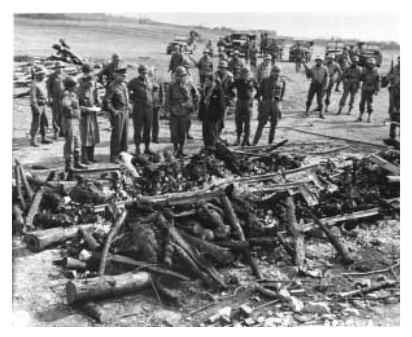
Figure 9. U.S. forces at Ohrdruf Concentration Camp, Harold Royall, courtesy of USHMM Photo Archive

witnesses and sees both them in the act of looking and what they saw. (See fig. 9.) These multiple and fractured lines of sight among the dead victims, the liberating U.S. army, and the retrospective witness, confirm some recent work that complicates the assumption that a monocular perspective represented by the camera rules the field of vision, as Metz suggests.<sup>30</sup>