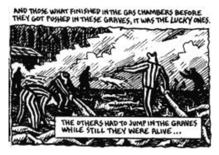
Figure 13. Maus II, Courtesy of Art Spiegelman

into a new graphic idiom he unhinges them from the effects of traumatic repetition, without entirely disabling the functions of sense memory that they contain.