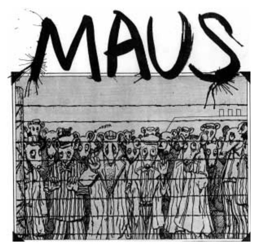
Figure 2. The First Maus, courtesy of Art Spiegelman

of others. These lines of relation and identification need to be theorized more closely, however—how the familial and intergenerational identification with one's parents can extend to the identification among individuals of different generations and circumstances and also perhaps to other, less proximate groups. And how, more important, identification can resist appropriation and incorporation, resist annihilating the distance between self and other, the otherness of the other.<sup>14</sup>