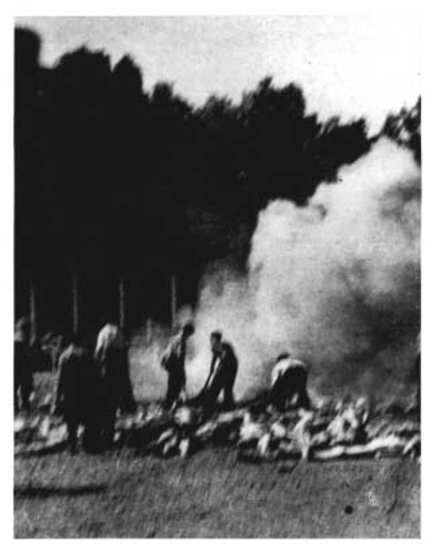
Figure 14. Clandestine image of Sonderkommando forced to burn bodies in Birkenau, Archiwum Panstwowego w Oswiecimiu-Brzezince , courtesy of USHMM Photo Archives

domestic and public spaces. Projecting photographs onto trees enables us to see memory as constructed, as cultural rather than natural.