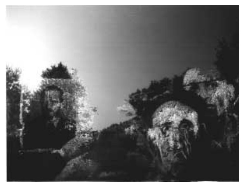
Figure 15. "Night and Fog,"