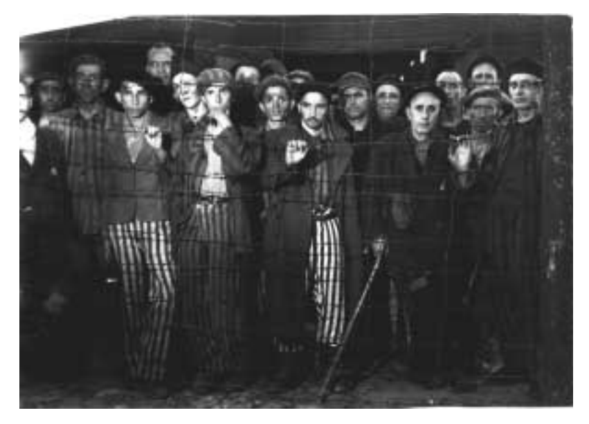
Figure 1. Buchenwald, April 1945.