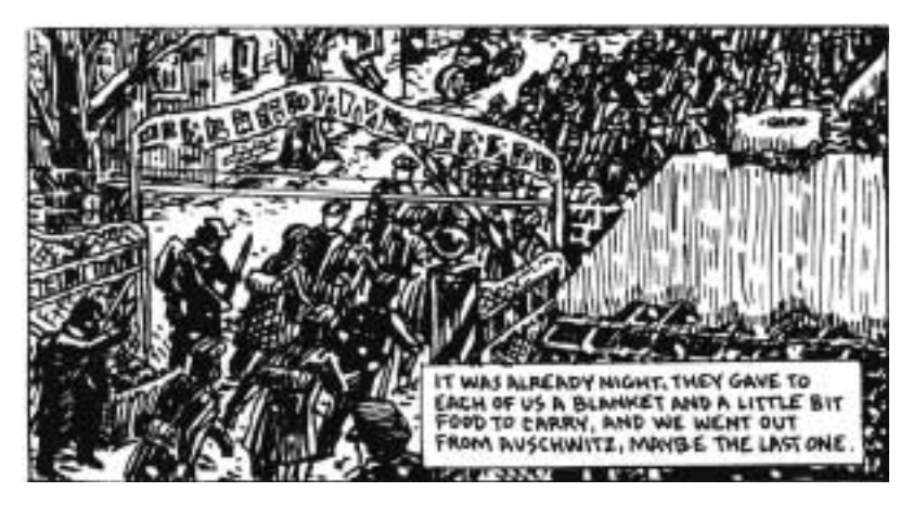
Figure 7. Maus II, courtesy of Art Spiegelman

dozer, perhaps mirror images of one another. In this specific context, one could say that these two machines, worked by humans, do a similar job of burial that represents forgetting; that they recall, however obliquely, another machine—the weapon. And that, when it comes to images of genocidal murder, the postmemorial act of looking performs this unwanted and discomforting mutual implication.