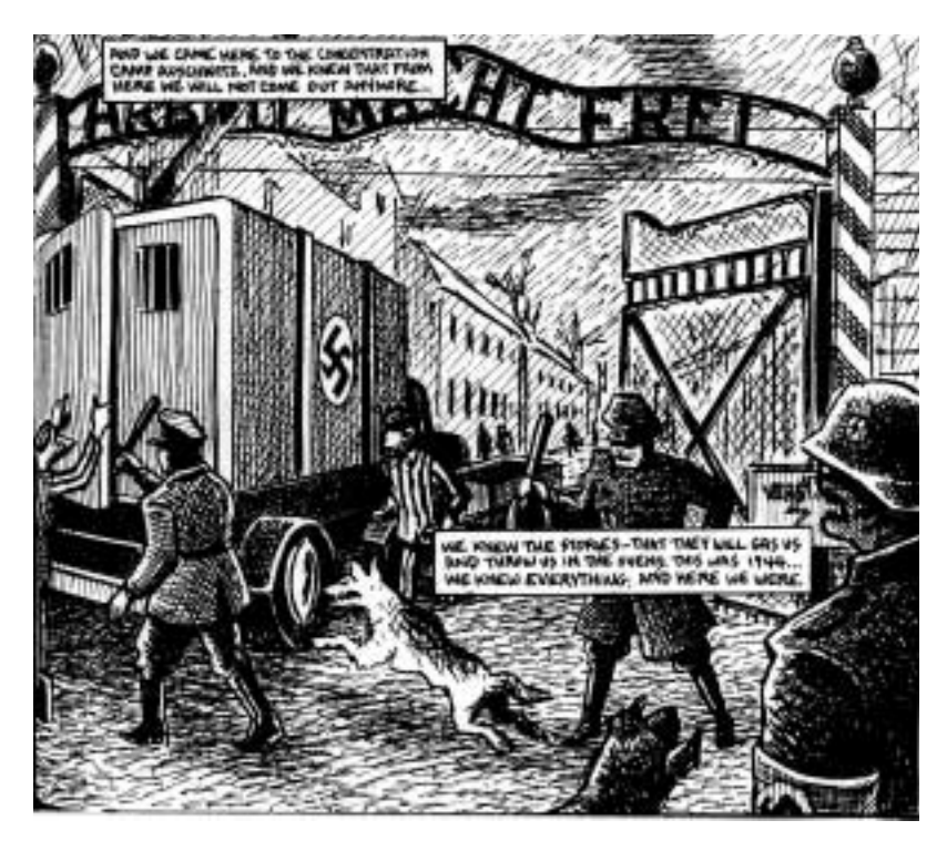
Figure 6. Maus I, courtesy of Art Spiegelman

we come to appreciate the extremity of the outrage and the incomprehension with which they leave anyone who looks.<sup>28</sup>