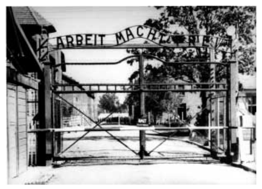
Figure 3. Gate to Auschwitz I