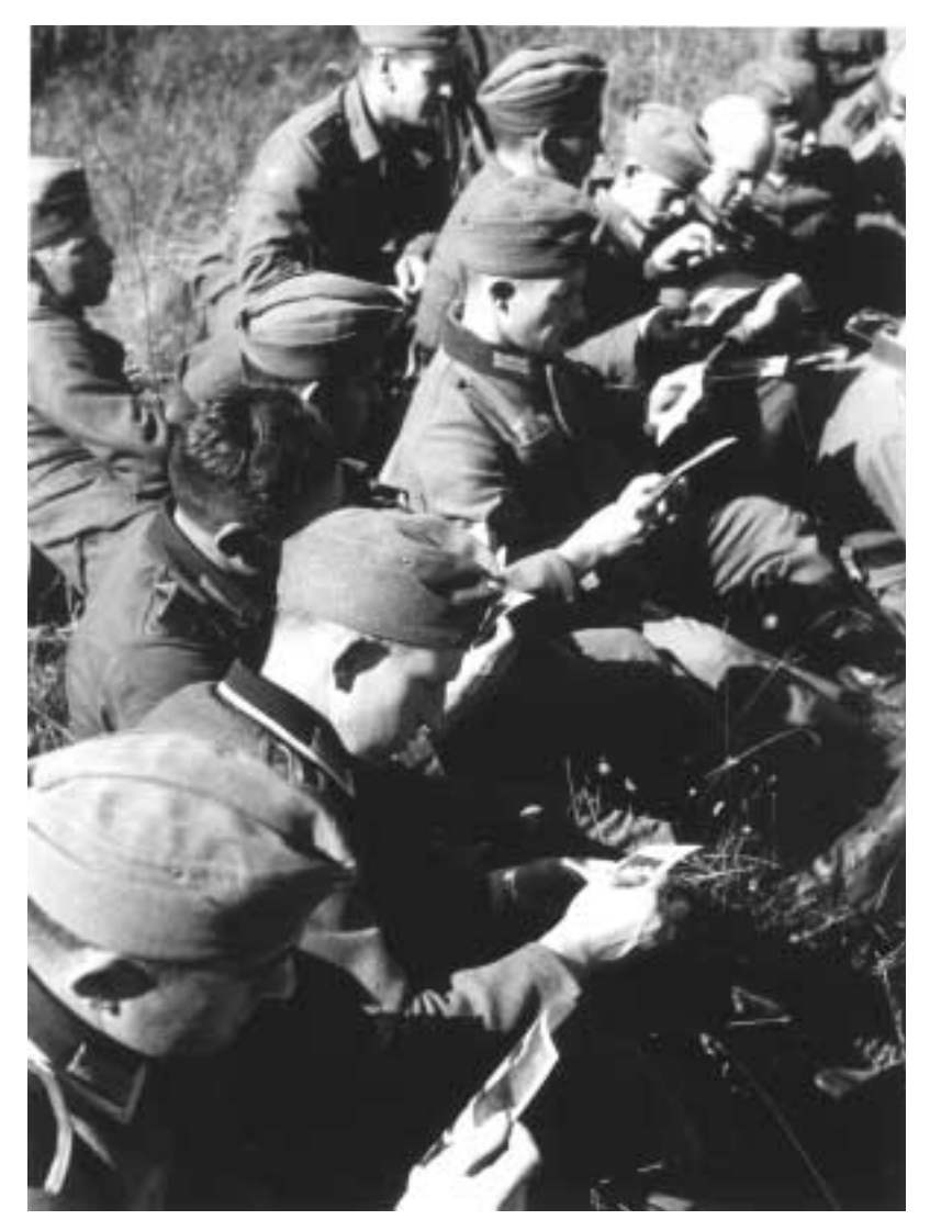
Figure 10. German soldiers examine photographs after executing a group of Jews and Serbs in a reprisal action, Serbia 1941, courtesy of ECPA ( Photo Cinema Video des Armées )

tographs associated with the Holocaust in particular, the very fact of their existence may be the most astounding, disturbing, incriminating thing about them. Perpetrator images, in particular, are taken by perpetrators for their own consumption. Recently I have come across a set of 38 images that bring this home with shocking force. (See fig. 10.) These are pictures of a reprisal action against Jewish and non-