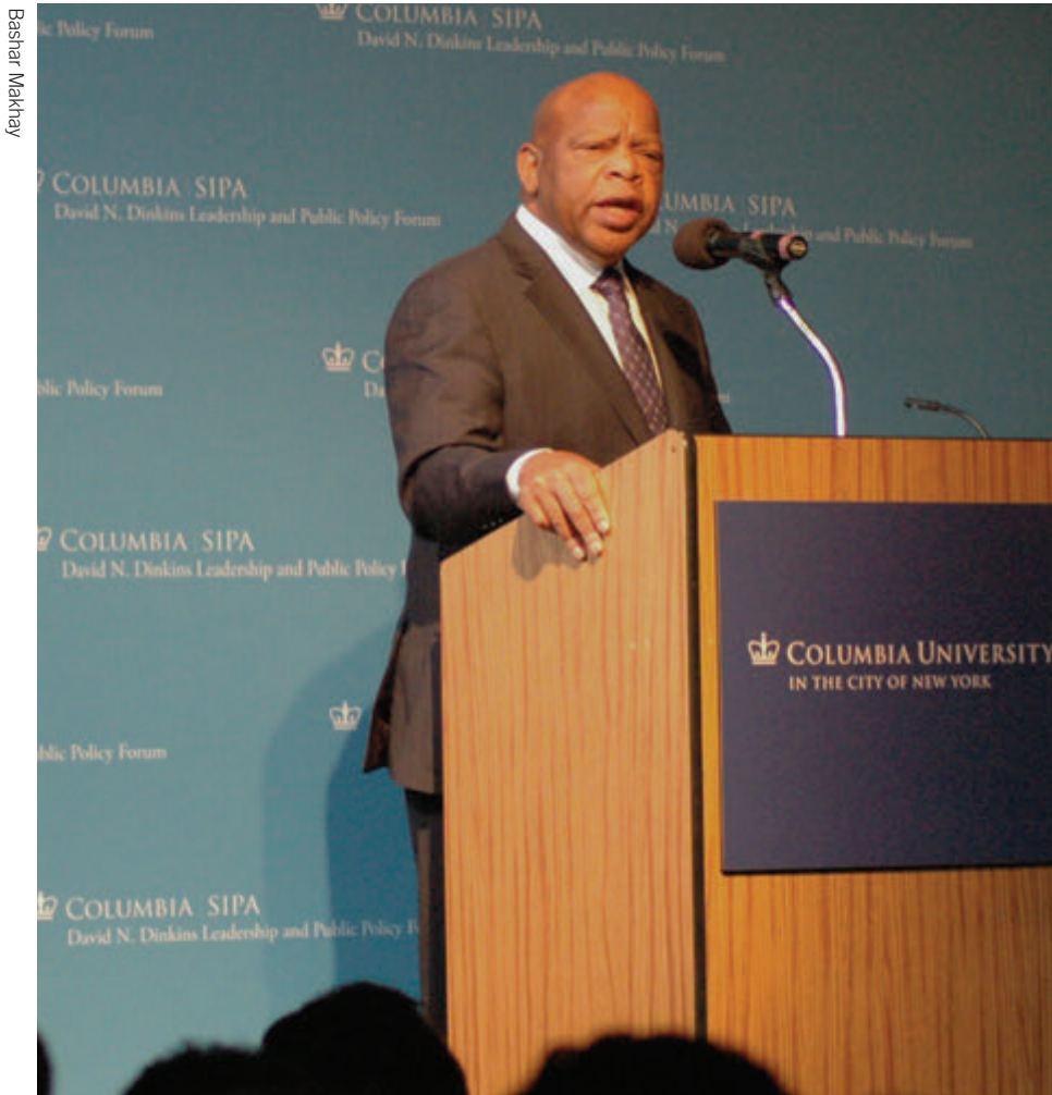
The Honorable John Lewis speaks at Dinkins Forum.

On March 30, U.S. Representative John Lewis gave a rousing speech to an audience of over 650 in Miller Theatre. Named for New York City's 106th—and first African American—mayor, the David N. Dinkins Leadership & Public Policy Forum has provided a vehicle for focus and dialogue around the dynamic elements of urban policies, programs, and initiatives for twenty years.