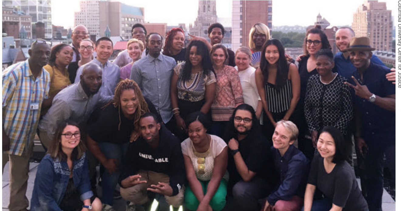
Columbia University Center for Justice

From left: Angela Davis, keynote speaker at Friday night event; 2016–17 Beyond the Bars Fellows from many schools across Columbia (Social Work, Teachers College, Columbia College, Arts, Public Health); other colleges (Rutgers, New York University, Borough of Manhattan Community College); and a variety of community and government organizations (Osborne Association, Vera Institute of Justice, Red Umbrella Project, Fortune Society, VIBE magazine, Center for Court Innovations)