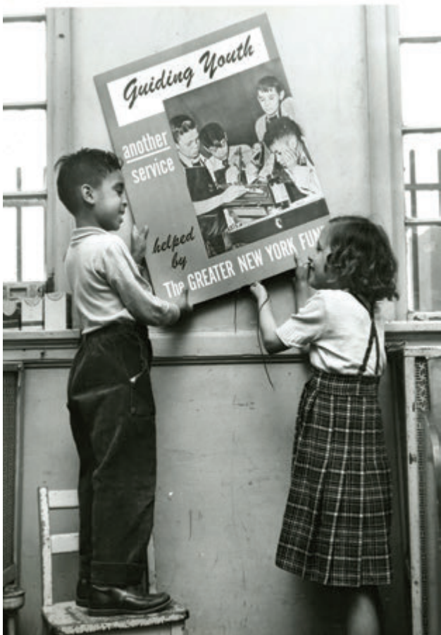
The Greater New York Fund, one of the first CCS grantees