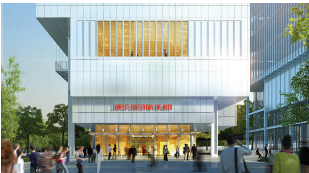
Columbia University Facilities and Operations

Lenfest Center for the Arts. Rendering by Renzo Piano Building Workshop (design architect) and Davis Brody Bond (executive architect).