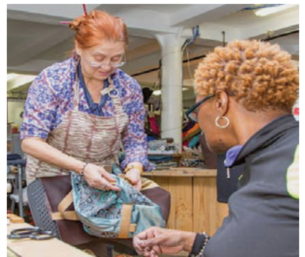
So Harlem Inc.